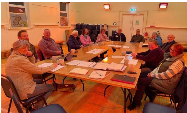
Image: Glenkens Community Spaces inaugural meeting in Balmaclellan Village Hall