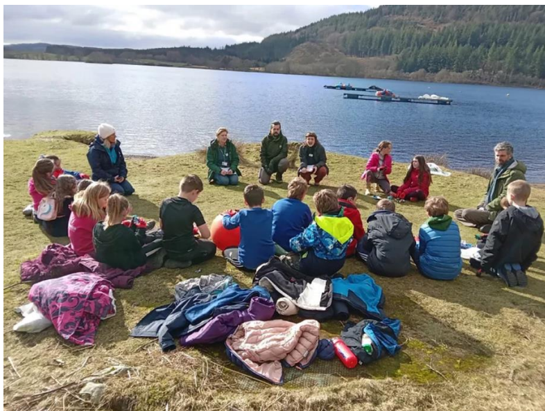
Image: Loch Ken Trust staff delivering an education session for local young people