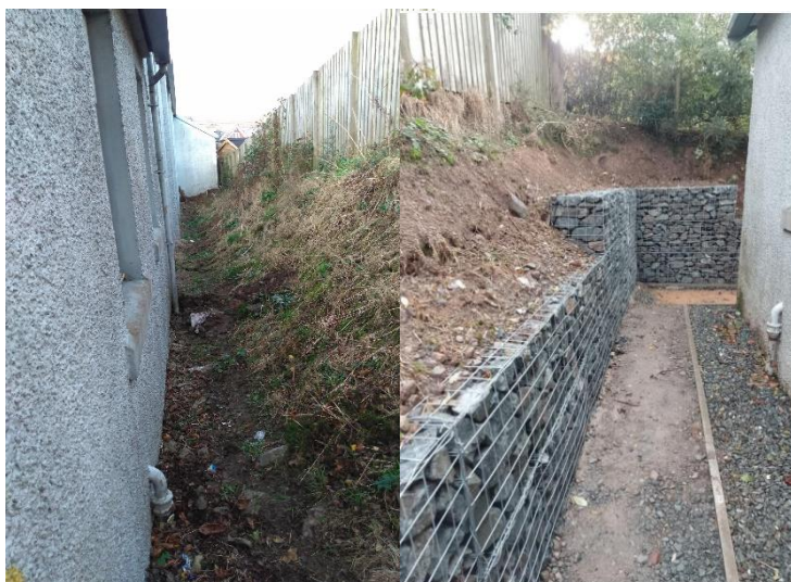
Image: Crossmichael Memorial Parish Hall before works to improve exterior (Left) and after (Right)