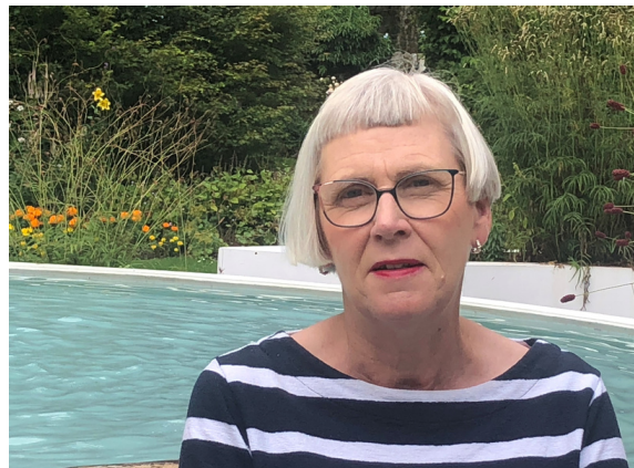
Chair, Glenkens & District Trust

I would also like to thank my fellow GDT trustees, Members and Associate Members for their support and Foundation Scotland for the expertise they bring to the work of the Trust.